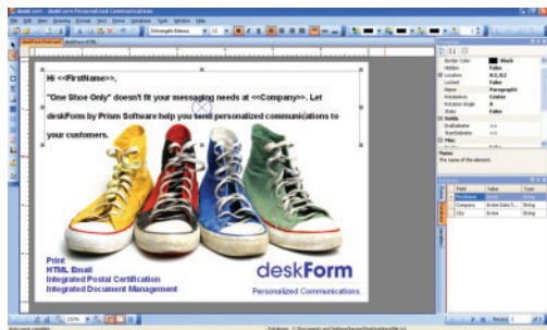
Easily set up print projects and merge images and data from flat files, Excel files, and other data sources.