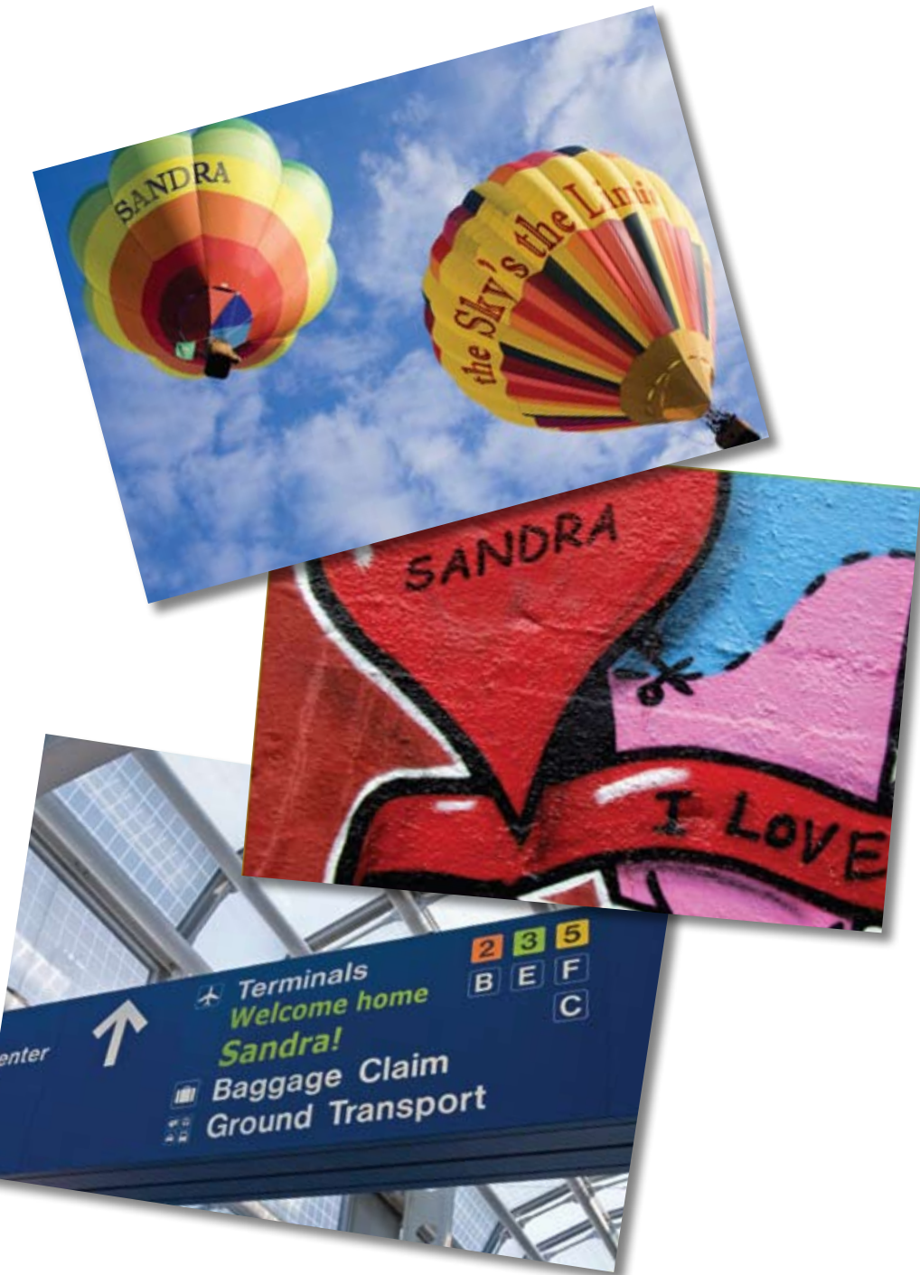
Darwin Software's Personalized Images for high-impact campaigns

Darwin VDP Software creates targeted, full-color printed mailers that deliver marketing campaigns with impact. With its easy-to-use workflow and automated features, it can help you produce complex variable data documents for your customers, quickly and cost-effectively. Its advanced features put you ahead of the competition, increase your revenues and drive the growth of your business.